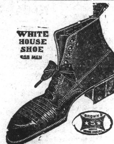
WHITE HOUSE SHOE FOR MEN