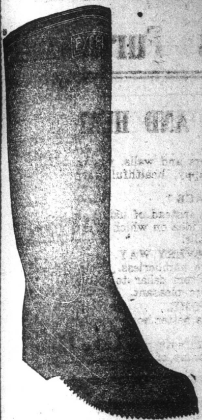
"EXCEL" Made 'All in One Piece'