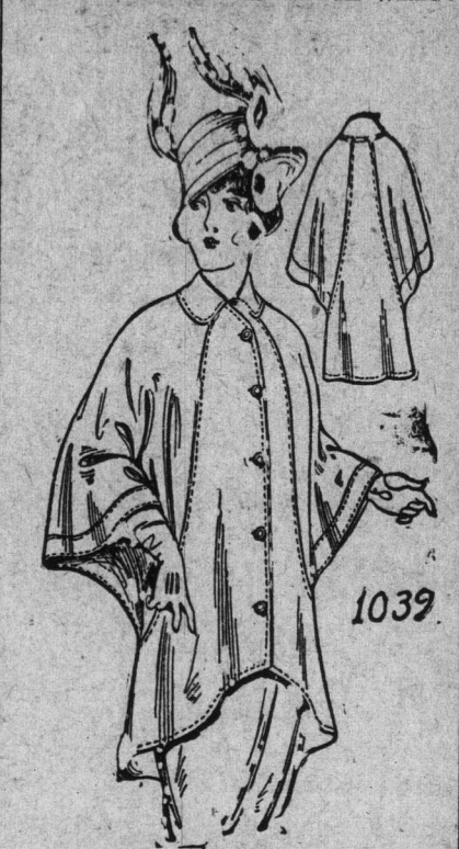
Ladies' Cape Coat.

Brown broad cloth was used for this model. It is cut with full cape sleeve sections, joined to the back and front in "raglan" style. The coat is provided with a lining. A rolling collar finishes the neck edge. The coat closes at the centre front. This model is one of the latest words in wraps. It is especially designed for comfort, its lines are graceful, and if made of heavy woollen fabric it will make a fine serviceable winter wrap. In silk, velvet, and evening materials, it is serviceable also for dressy wear. The pattern is cut in 3 sizes: Small, Medium and Large. It requires 4 1/2 yards of 44 inch material for a Medium size.