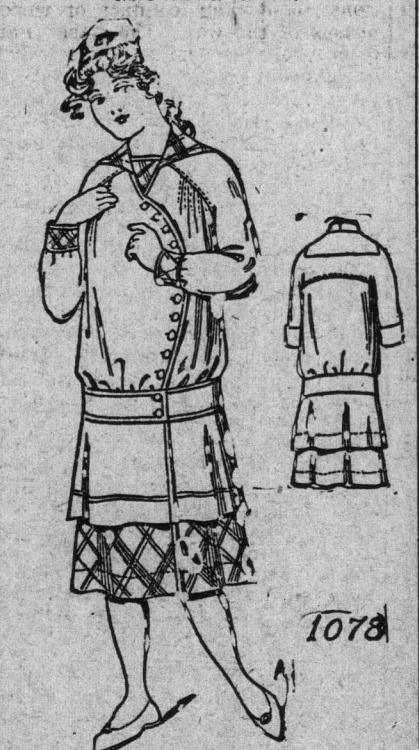
Girl's Dress with Long or Short Sleeve, and Tunic Blouse.

1078.—A PRETTY STYLE FOR THE GROWING GIRL.