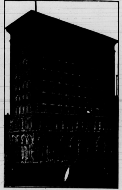
Union Bank Building, Winnipeg