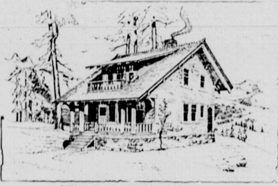
DESIGN "VANCOUVER" 31ft. 6in. x 32ft.

Your first impression of this House is bound to be favorable. Outside appearance is very picturesque, having a Full Six foot Verandah with Large Square Porch Posts.