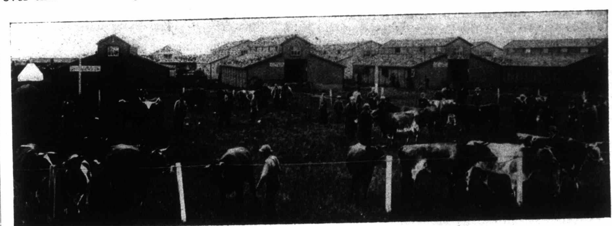
A FEW OF THE SHORTHORN HERDS IN THE JUDGING RING, WINNIPEG INDUSTRIAL EXHIBITION.

The land occupied is very extensive. We had driven six miles through his land when driving driven six miles through his land when driving from the station on the north side, and the most of his sheep were pasturing on land fifteen miles beyond the buildings on the south, leaving all the grass on the nearer stretches for winter feed. The sheep are all divided up into bands of 2,000 each. Each band is attended to by one man, who watches over them and is responsible for their good man-