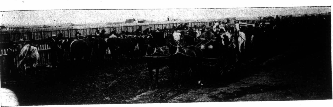
LIVE STOCK PARADE, WINNIPEG INDUSTRIAL EXHIBITION.