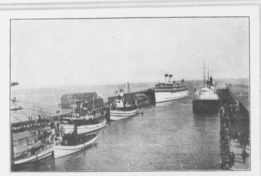
A SUMMER'S AFTERNOON ON THE WATER FRONT.