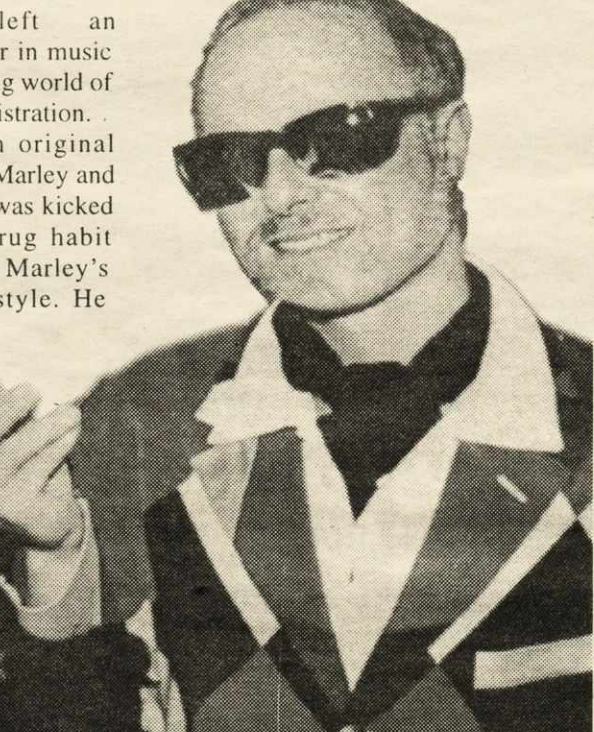
COOL DADDY: Travis today, "Don't hate me 'cuz I'm there, man."

Travis won't play any instruments, instead adding rap interludes and b-boy moves!