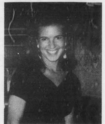
Thanks for an unforgettable week! L'homme individuel

A damn fine reason why Québec should not separate: