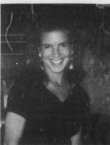
Thanks for an unforgettable week! L'homme individuel

A damn fine reason why Québec should not separate: