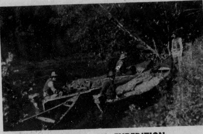
STARTING AN EXPEDITION