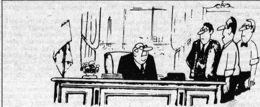
"I'm terribly sorry sir, but in the process of cutting out programs for the poor we inadvertently cut out a program for the rich."

In the meantime, the CFS is organizing a campaign to pressure the federal government to accept the recommendations of the Task Force.