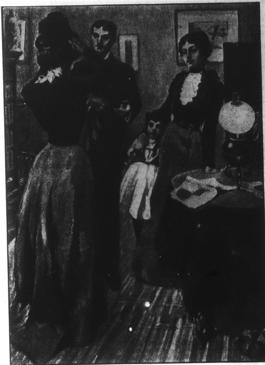
"I WENT TO TWO TRAINS, AND THEN I GAVE YOU UP."

"Lucy!" "Caleb!" she responded, helpless. The speed increased; she had a last glimpse