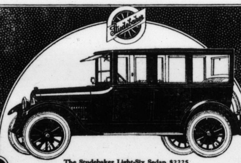
The Studebaker Light-Six Sedan $2225