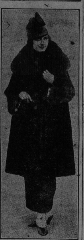
Seldom have we illustrated a HUDSON SEAL GARMENT more luxurious than this with its Shawl Collar of Natural Mink.

London, Nov. 12.—A special congress, comprising representatives of all organized labor, was called today to meet in London on December 9th to discuss the nationalization of the mines. It will consider what action might be taken to compel the Government to bring into effect the resolutions of the Sankey Commission that nationalization be effected.