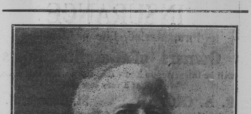
SIR WILFRID LAURIER