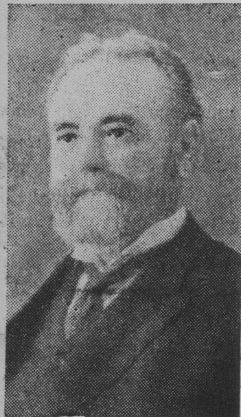
HON. WM. PUGSLEY

The workmen of Canada will do well to contrast the passive attitude of the Conservative Administration during the eighteen years, from 1878 to 1896, with the active record of the Liberal administration, from 1896 to 1898, toward labor, though the latter covers a shorter period of time, and to judge for themselves which party is deserving of their support.