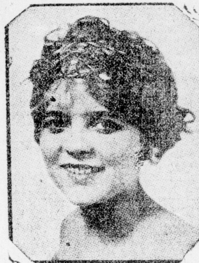
BLANCHE SWEET The Star

Still the topic of conversation in Detroit, where it had its premier showing.