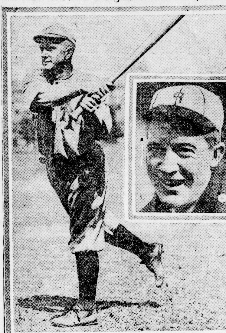
WILLIAM KILLIFER &amp; GROVER ALEXANDER.

This Pair Cost in Neighborhood of $60 000