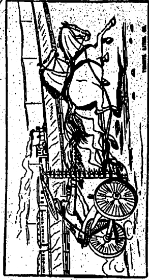
LET HER GO! NO HARM CAN COME.

27,661 Massey-Toronto Mowers have already been