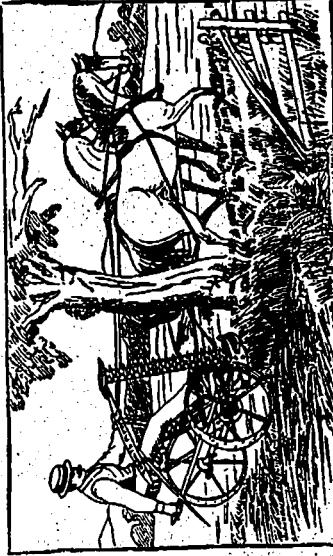
PASSING A TREE—KNIFE IN FULL MOTION.