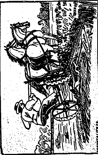
OVER A STONE—KNIFE IN FULL MOTION.