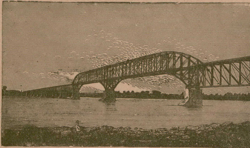
ST. LAWRENCE RIVER BRIDGE, CANADIAN PACIFIC RAILWAY, LACHINE, P. Q.