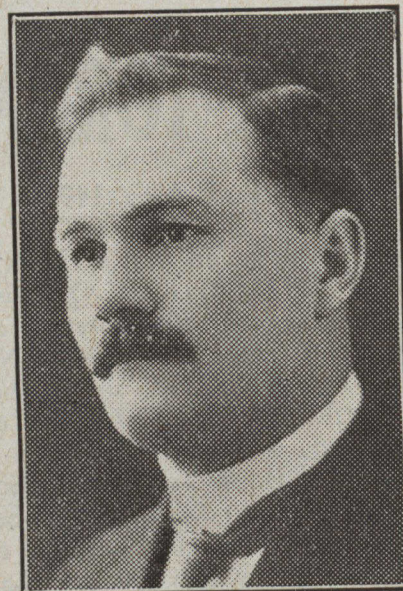
HON. C. A. DUNNING, Chairman, Saskatchewan Victory Loan Committee.

Reports received by telegraph from nearly every province were unanimously in favor of going on with the drive as scheduled. Even one or two of the few who had previously suggested postponement declared that conditions were brightening and that they now favored proceeding full steam ahead.