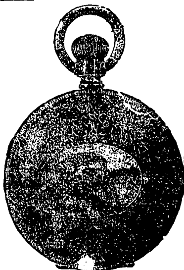
OUR "RAILROAD" WATCH

This Watch is a Perfect Time-keeper, UNEQUALLED FOR RAILROAD PURPOSES. It has 16 ruby jewels in sunk setting, Compensation Balance, Jewelless Hairspring, Patent Pinion, and Regulator adjusted to heat, cold and position. Portable Shock Dial, Stem Wind and set. Guaranteed for five years. Fitted to our 14 kt. Gold Filled Engraving Case, warranted to wear equal to Gold for 20 years. Price, $25.00 Cash. Mailed to any address in Canada on receipt of amount; or on receipt of $1.00 we will forward by Express, C.O.D. for balance, with privilege of Examination. The same movement fitted to our 14 kt. Gold Filled, open Face, Screw Case and Back Case, guaranteed for 20 years, for $22.00 Cash.