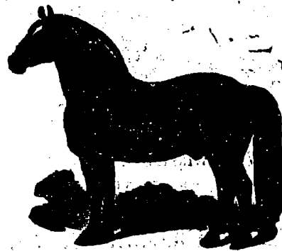
Patrole No. 2630 (1167).