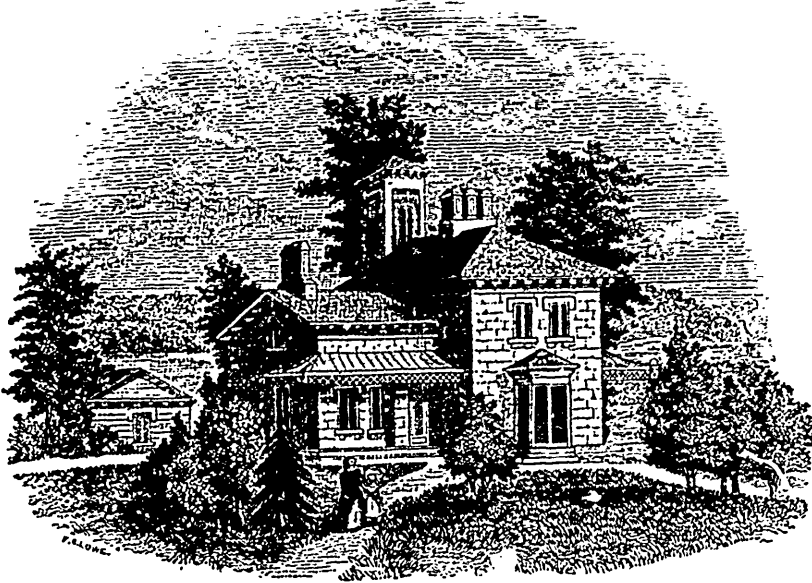
AN ITALIAN COTTAGE.

"There is nothing" says Downing "that more powerfully affects the taste and habits of a family—especially the younger members of it—than the house in which it lives. An uncouth, squalid habitation is little likely to awaken that attachment to home, that love of good order, and that sense of propriety and elegance in social deportment which are so much developed by that home where a certain proportion, a certain fitness, and a sense of beauty are every where visible."