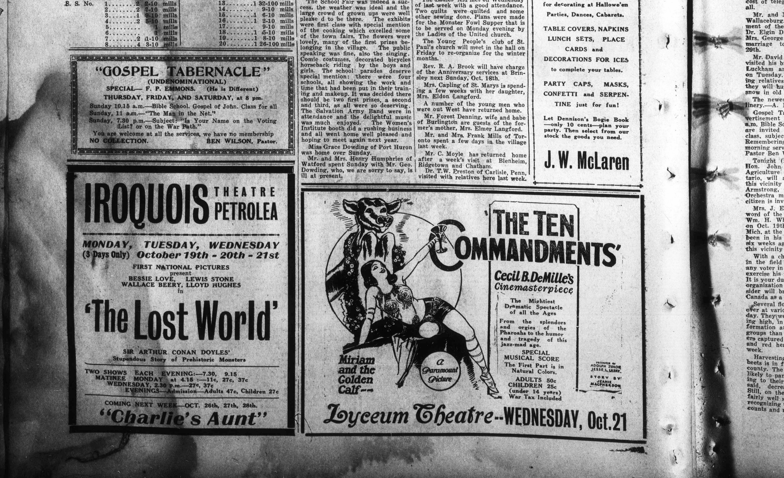
TABLE COVERS, NAPKINS LUNCH SETS, PLACE CARDS and

for decorating at Hallowe'en Parties, Dances, Cabarets.