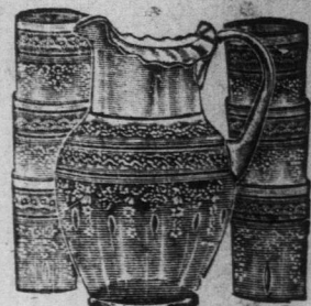
LEMONADE SETS 7 pieces, from