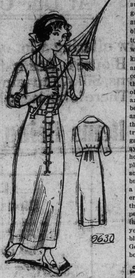
Dress for Misses and Small Women.

The Home Dressmaker should keep a Catalogue Scrap Book of our Fashion Plates. These will be found very useful to refer to from time to time.