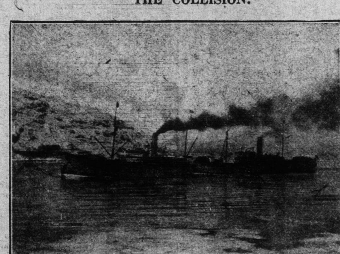
The Bonaventure and Beothic.