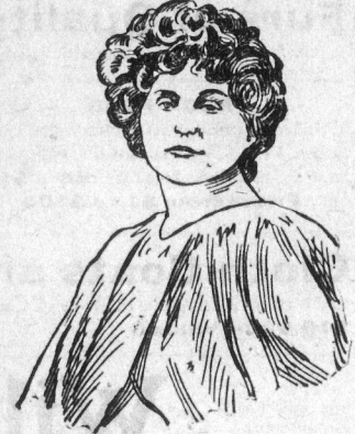
MARIE CORELLI'S FIRST PHOTOGRAPH.

"I am somewhat reluctant," she writes, "to see it so placed, because it has nothing whatever to do with the story, which is told in the following pages, beyond being a faithful likeness."