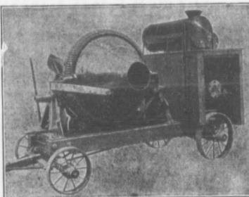
No. 1 Smith Mixer on Trucks With Gasoline Engine.

Are Unexcelled for Rapid and Thorough Mixing. They are the Simplest and Strongest in Con- struction. Capacities up to 350 Cubic Yards per Day.