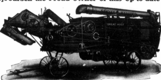
"GREAT WEST," Built in Seven Sizes