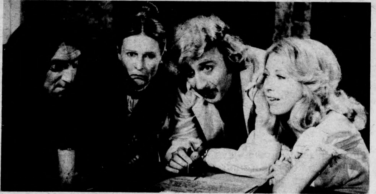
Marty Feldman (Igor), Cloris Leachman (the spooky caretaker), Gene Wilder (Dr. Frankenstein) and his assistant Teri Garr mull over the plot of Young Frankenstein. Such as it is.

bad movie if it weren't for the sorry waste of a superb cast, authentic locations and eerie photography, which captures the same black-and-white cobwebs, rain and lightning which rattled the audience's teeth in 1931.