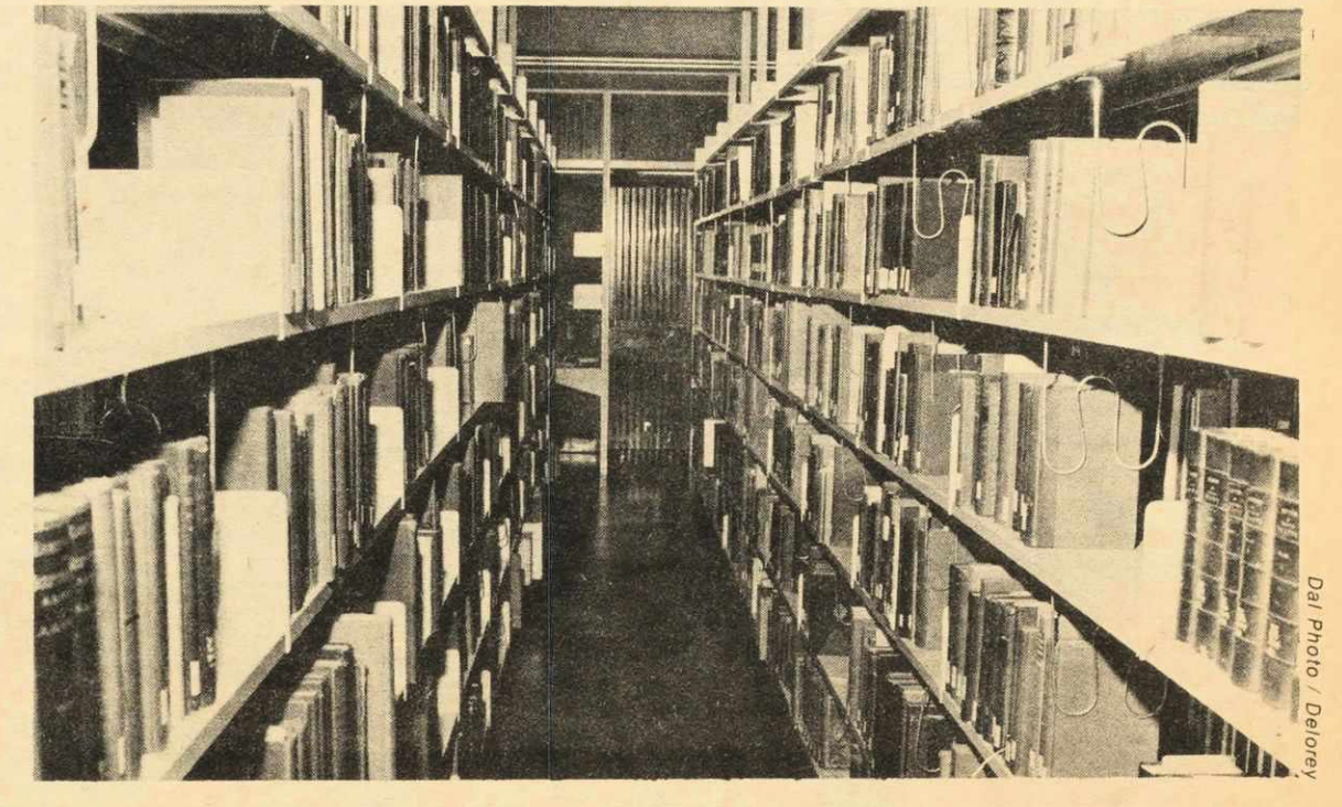
A Senate report has outlined some of the weaker areas in the University Library collections. Periodicals and some collections have been especially hard hit by reduced acquisition budgets.

The report is presently under consideration and circulating among the faculties concerned.