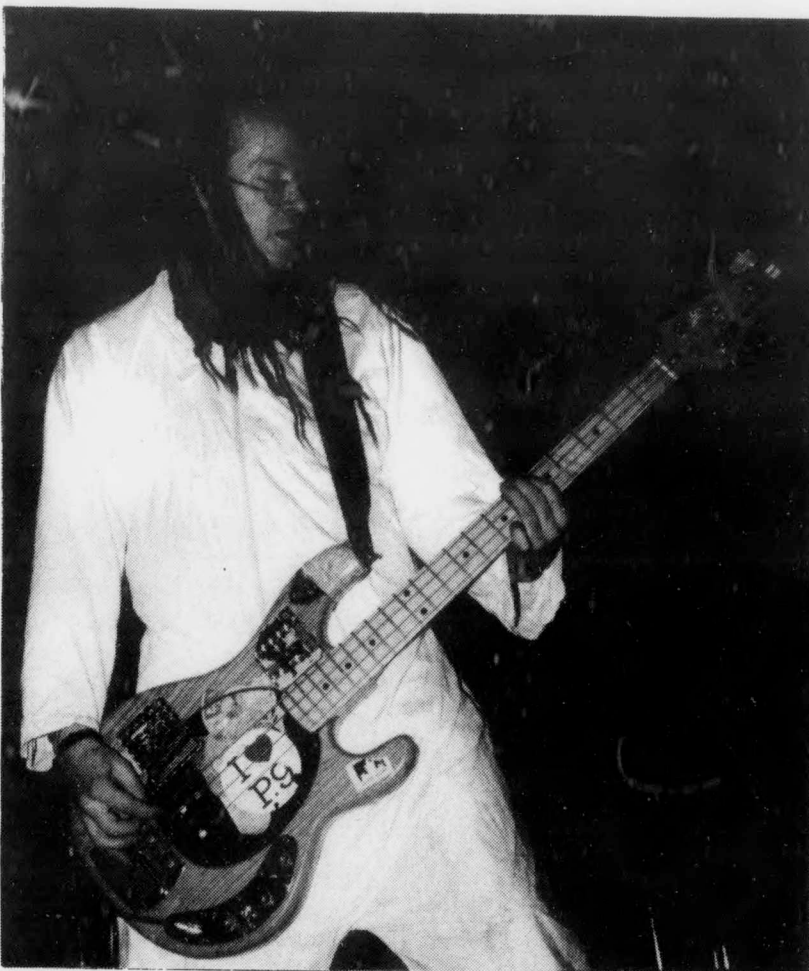
Bassist from Furnaceface gets hot.