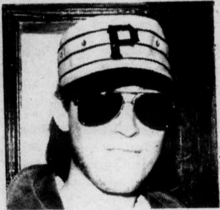
Kramer Everything in the whole world.