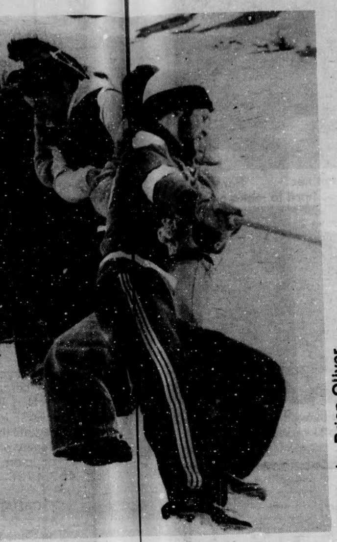
available. Come out and join in!