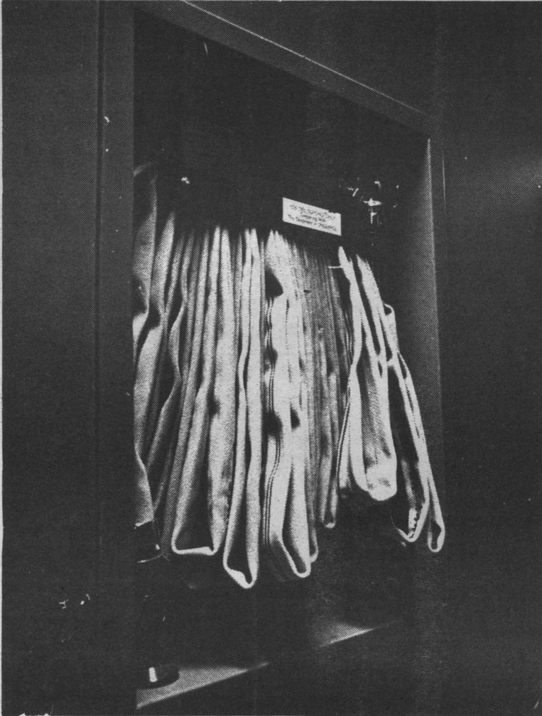
The culprit hose hangs in guilt after the weekend's rampage.