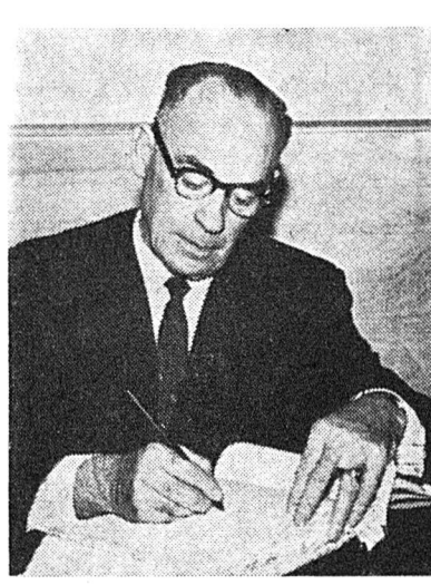
. . . at his desk

The greatest tribute paid to him during his career came shortly becontinued on page 2