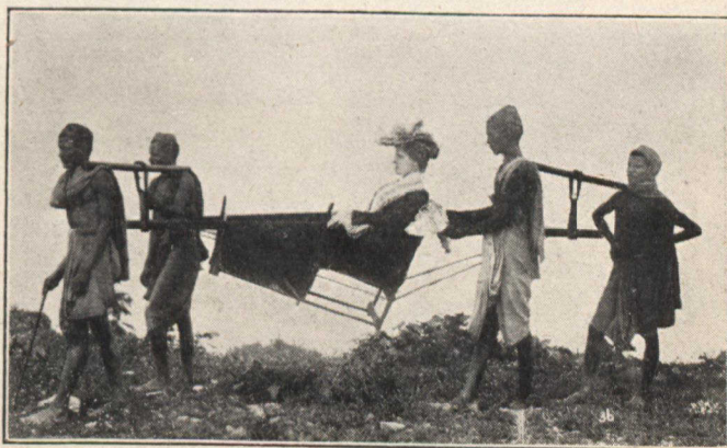
In the Hill Stations of India.

At all the other principal points of interest in the Rockies, the Canadian Pacific maintains splendid, well appointed hotels in the thoroughly equipped fashion for which they are everywhere famous. At these hotels every provision is supplied the tourist for the most complete exploration of the district. Should he wish to break a record as a mountain climber, he will find Swiss guides on hand to accompany him. If he is not of the