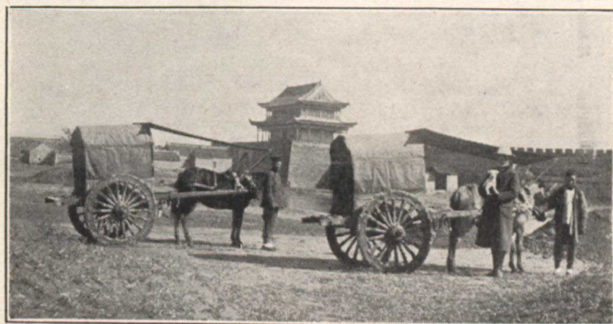
Chinese Springless Carts.