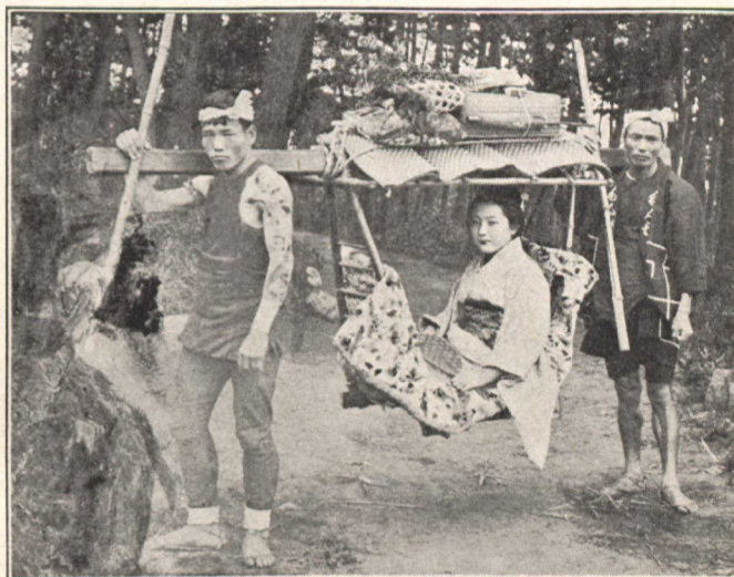
A Japanese Travelling Chair.

Banff and its surroundings alone offer an attraction which every summer make it the destination of thousands of tourists. Here is located the headquarters of the great Canadian National Park of over 5,000 square