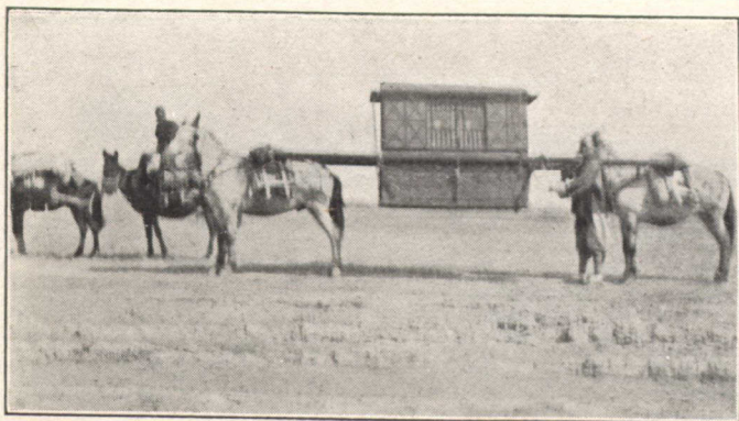
A Horse Sedan-Chair in Honan, China.

spends his spare time at the magnificent summer home of his brother-in-law, Lord Mount Stephen, at Grand Metis, on the south shore of the St. Lawrence nearly opposite Tadousac. Among the notables who make an annual pilgrimage to Murray Bay may be mentioned the family of President Roosevelt (the President of course not being allowed to leave the United States during his term of office), U. S. Secretary of War Taft, Edward Blake, M.P., and a host of people from western points who find this an ideal spot for a quiet holiday.