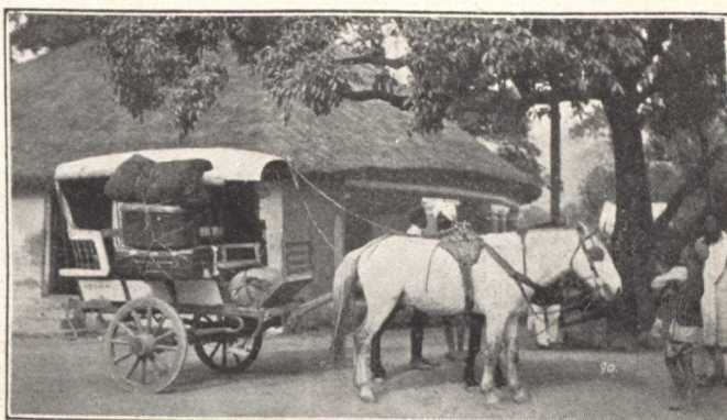
A Tonga—Used on the Plains of India.

the Rockies. The well known resorts, enumerated above, have something of interest for the naturalist, the geologist and the botanist as well as for the ordinary tourist, for the artist, the hunter and the fisherman as well as for the health seeker.