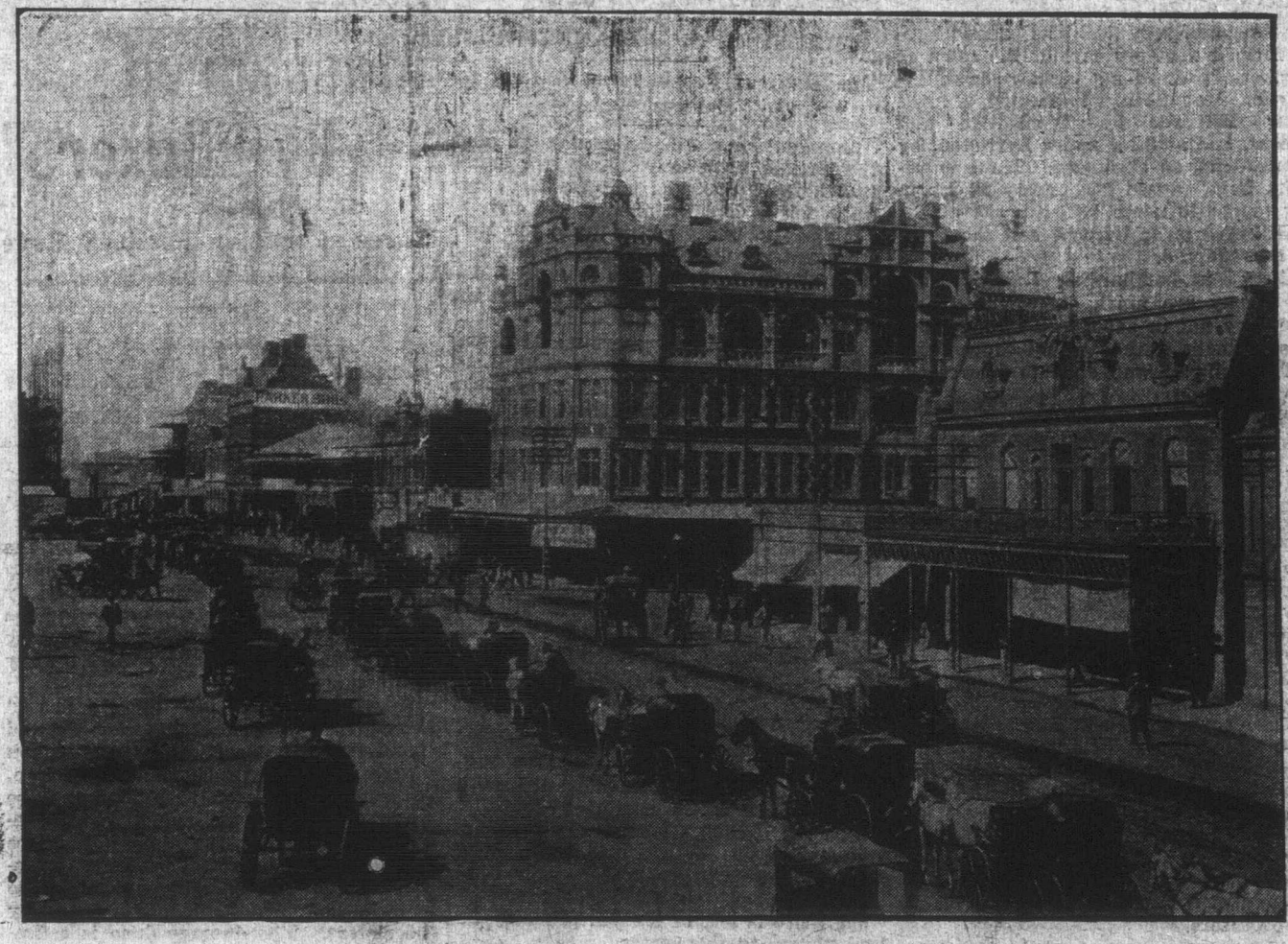
MARKET STREET, MARKET SQUARE, JOHANNESBURG.

Otter, from 21st to 25th of April, has and because our remonstrances were met