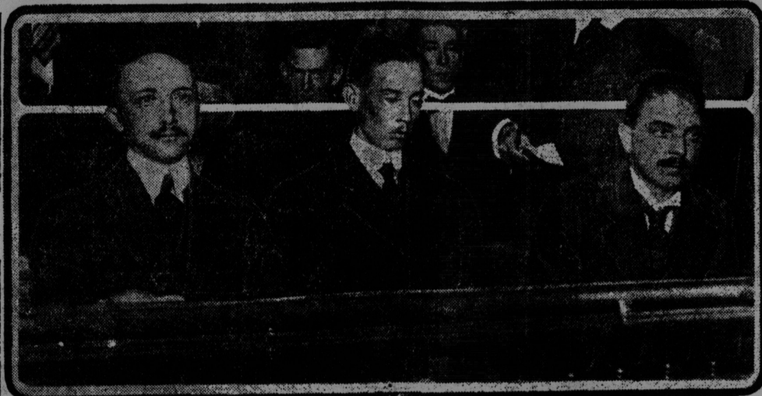
Three German army men were captured in a lonely wood on the Balmuccia Sunday night with five newly invented bombs, map of New York and other suspicious evidence...