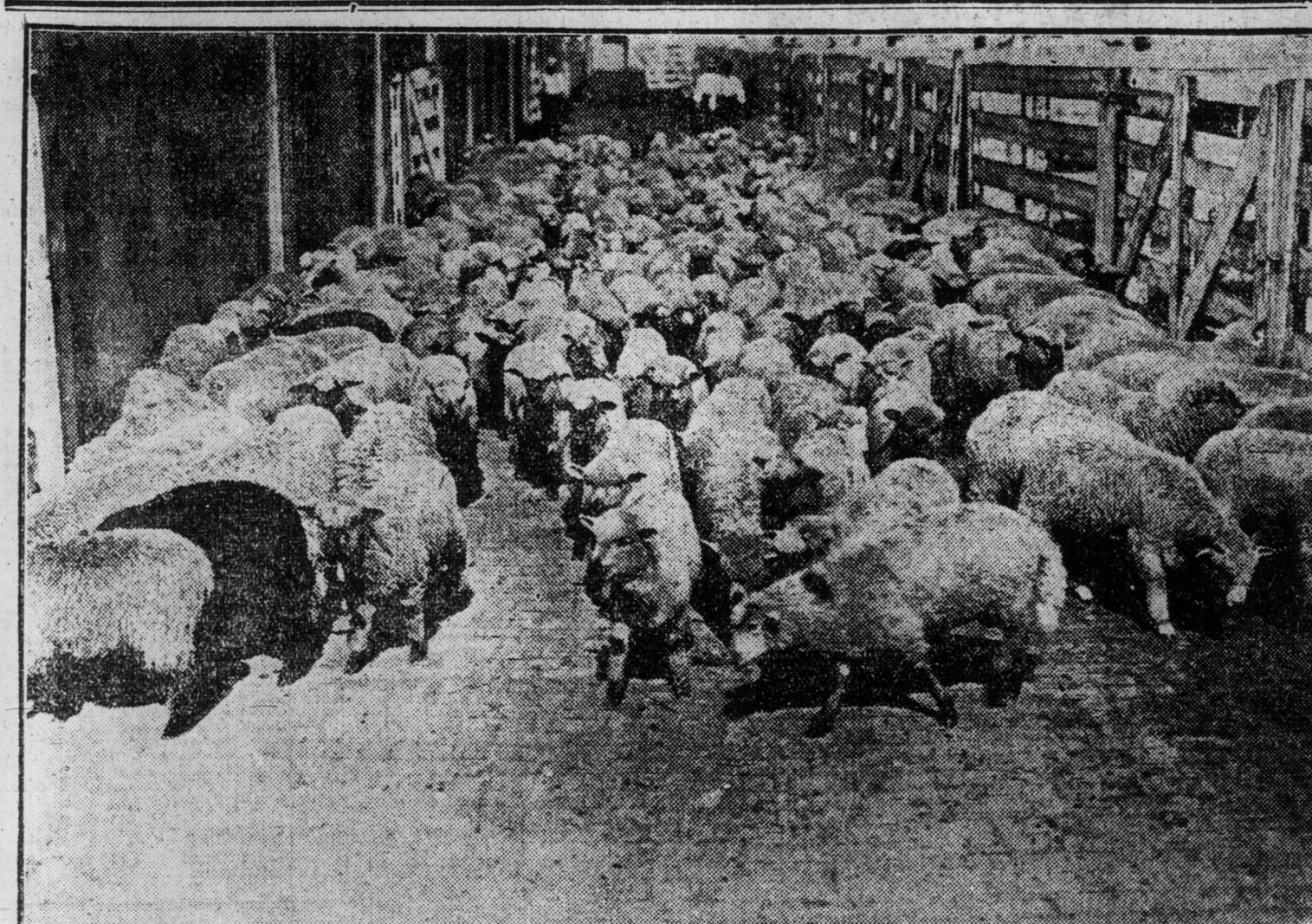
A flock of American lambs sold on the Toronto market yesterday in competition with Canadian lambs.