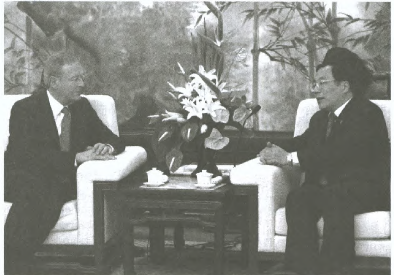
International Trade Minister Jim Peterson meets with Zhou Yupeng, Vice mayor of Shanghai.