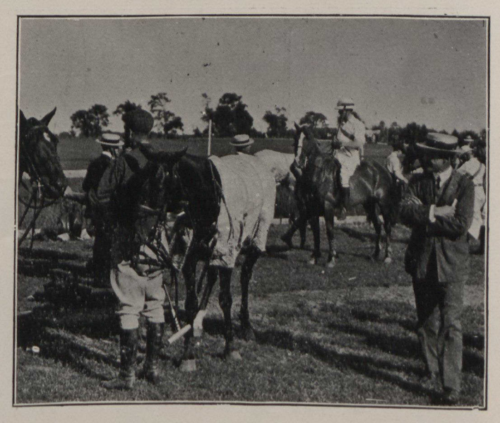
A Canadian Polo Tournament Much interest was taken in the Polo Tournament at St. Lambert, Que., for the championship of Canada. The competing teams were Calgary (last year's champions), championship without losing a game. The pictures show the style of pony, the costume of the players and the sticks used.