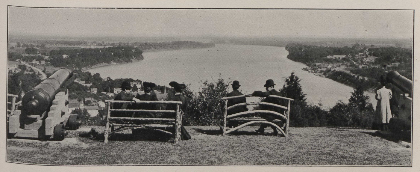
The Niagara River Approaching Niagara Falls by water, one passes Queenston Heights, surmounted with the monument to the hero, Sir Isaac Brock, who fell on that spot in the hour of victory. From this historic ground this picture of Niagara River was taken the other day.