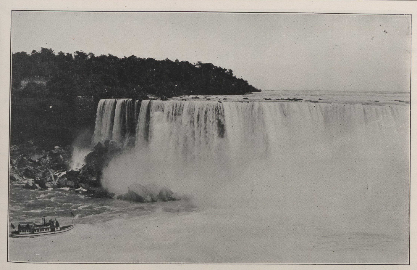
The Canadian Niagara This is a new picture of Niagara Falls, showing the Canadian fall, with Goat Island at the left. In the foreground the steamer "Maid of the Mist" is creeping up towards the foot of the falls. System. This is a new picture of Niagara Falls, showing the Canadian fall, with Goat Island at the left. In the foreground the steamer "Maid of the Mist" is creeping up towards the foot of the falls.