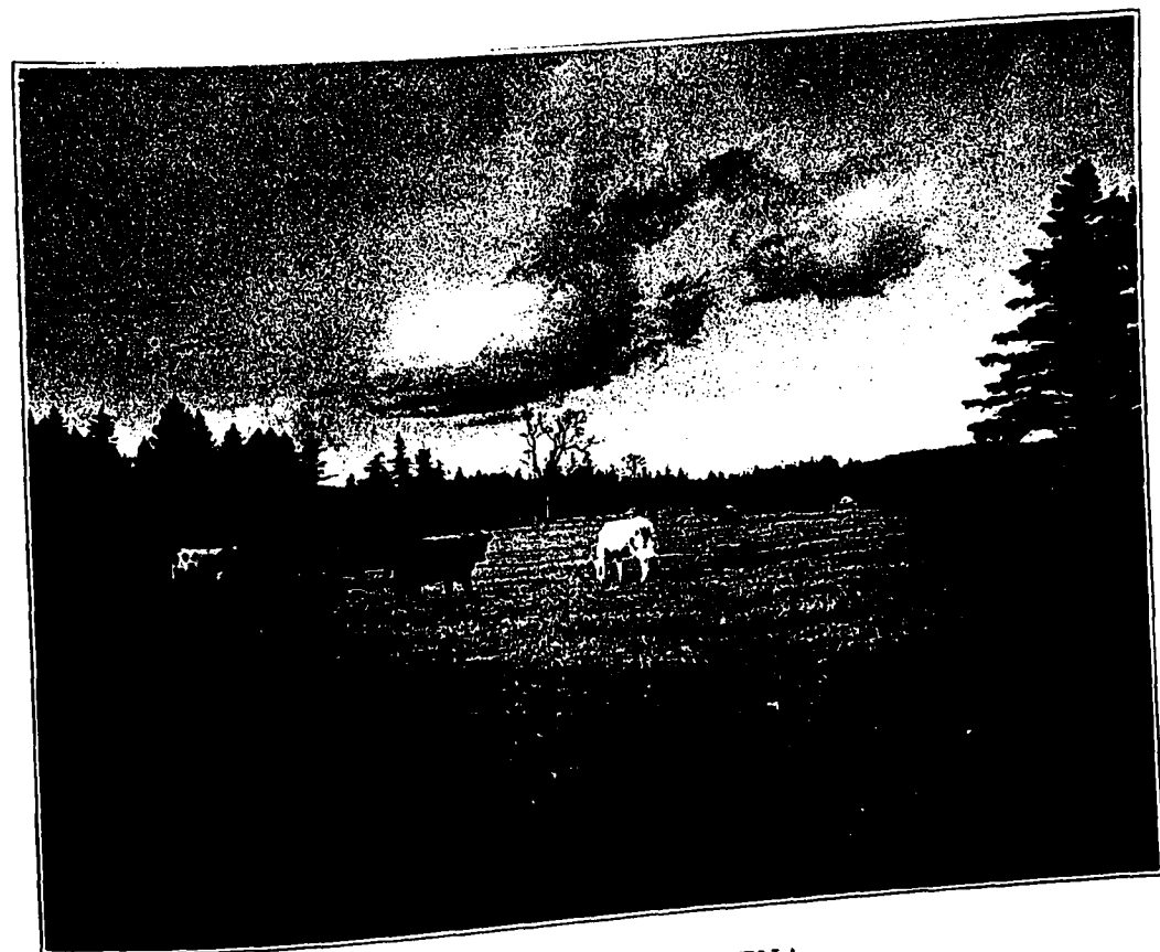
A VIEW OF ALTADENA