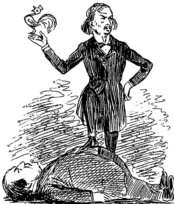
THE APOTHEOSIS OF CHAPLEAU!

Sir A. Campbell—I MAY MENTION, THAT I DO NOT IN ANY SENSE REPRESENT CANADA; I AM MERELY HERE FOR A HOLIDAY AT THE PUBLIC EXPENSE.