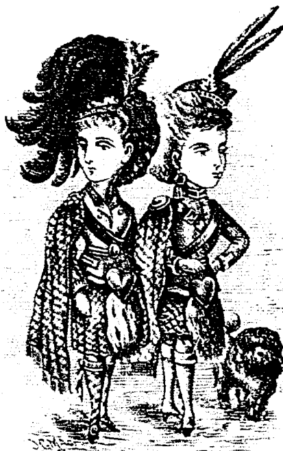
THE KILT COSTUME

The above improvement on the present style of Ladies' Fashions, was suggested by the following extract from a recent number of the CANADIAN ILLUSTRATED NEWS: