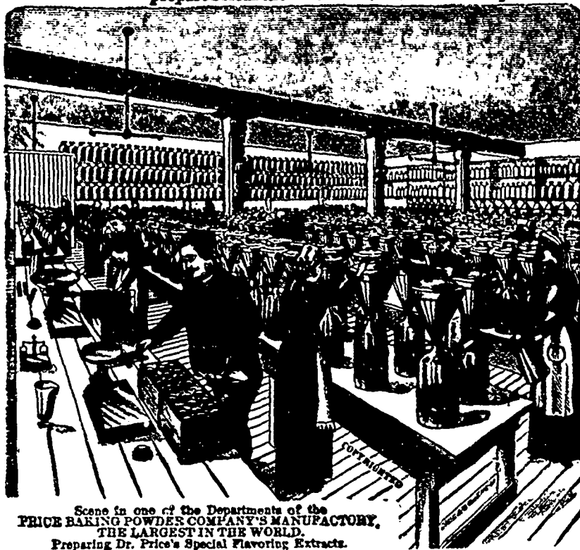
Scene in one of the Departments of the PRICE BAKING POWDER COMPANY'S MANUFACTORY. THE LARGEST IN THE WORLD. Preparing Dr. Price's Special Flavoring Extracts.

Dr. Price's Extracts, Vanilla, Lemon, Orange, Etc., prepared from the true fruits, flavor deliciously.