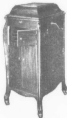
VICTROLA XI. $125

will more than make up for the increased Piano business that would be yours under normal conditions. They will pay the expenses and give you a good big profit. Some of your choice piano "prospects" who are passing up the big purchase this year want a Victrola now . They simply must have music, you know, and there is a Victrola for everybody —$20 to $300.