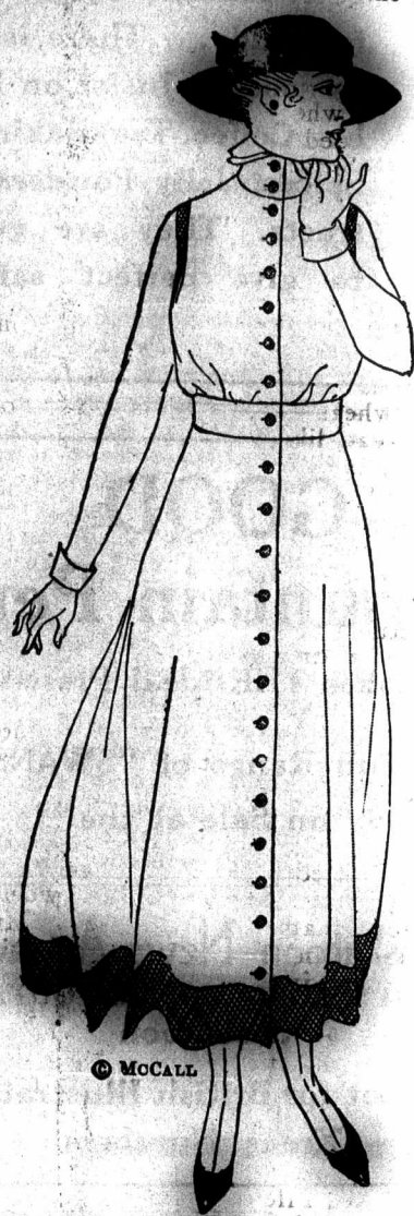
6912 Braid-Trimmed Gabardine

becoming; and for the more conservative there are wonderful blues, golden browns, and other dark, rich shades which will harmonize beautifully with broadcloth, satin, velvet, taffeta and the other daytime materials. Malines in high up-standing ruffles, bows, rosettes and folds is being used considerably for these small toques. Gold net or lace toques, with frills of dark brown or black net or malines, wired into shape, are especially effective for both afternoon and informal evening wear. Quaint neck-fixings often accompany these smart little hats; an up-standing frill or two of the malines to match the hat, banded through the center with a narrow fold of velvet or satin corresponding with the frock, form becoming neck-ruches and afford an effective finish to the costume.