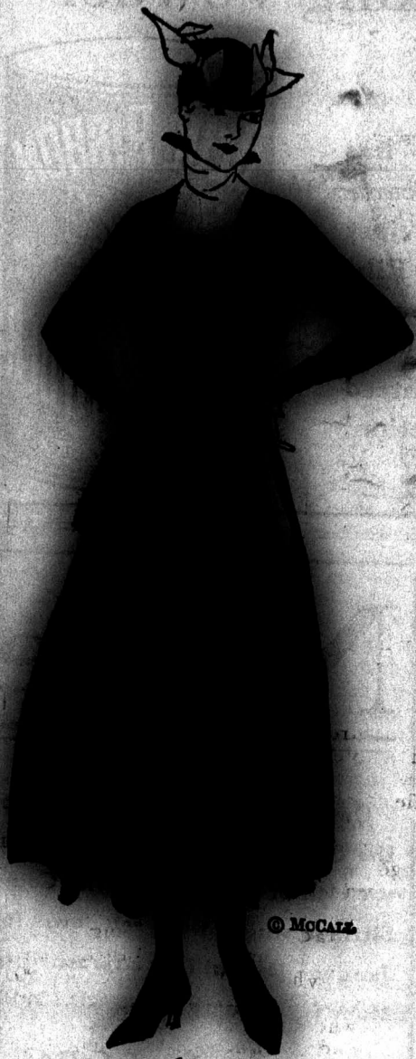
6925 Fur-Trimmed Black Velvet

For real comfort, both in dancing and skating, the small hat is necessary. This is usually a bright contrast to suit or frock; for instance, there is a charming shade of brick red that is much favored with blue serge and black velvet dresses and suits. A bright currant velvet is also favored, and bright coral too is attractive for those who find the shade