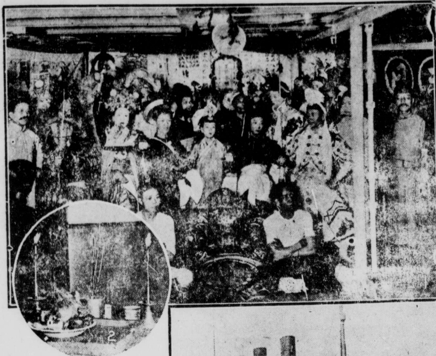
1. Costumed actors rest from their antics. 2. The altar and offering. 3. S.S. "Empress of Asia" aboard which the other pictures were taken.

In a little steel bound compartment for a hundred Canton Coolies stand or squat in the stifling heat, which seems to draw through the walls in sticky beads, moisture from the sea without. The sickening smell of punk and burning sandal wood pervades the heavy atmosphere, and the ear is tortured by the wall of musicless instruments of reed and string, and the monotonous tump-tump, tump of a skinny knuckle on a native drum. The dim light is thrown by two long tallow candles, which burn before and cast waves, line rows upon a hideous joss, the grotesqueness of which is accentuated and exaggerated by the moving shadows on its face. Before this joss, which the cotton garbed coolies revere in their silence, is a platter of fruit and chicken—their humble offering. But the food offering does not suffice to win the good graces of this terrible and austere god, neither does the so-called music sufficiently influence it on behalf